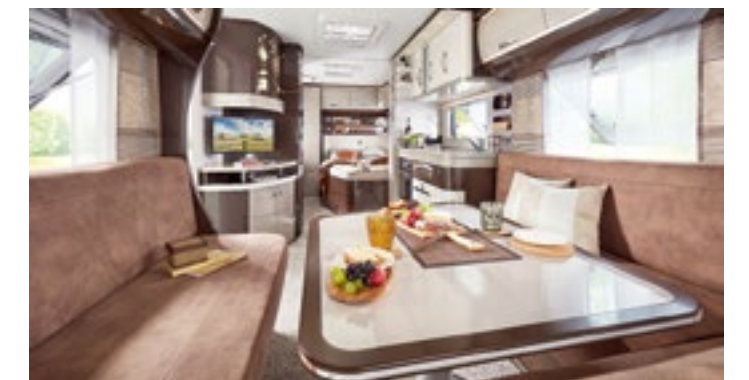
FURNITURE FINISH: Bronze, Stone Grey, Magnolia Metallic UPHOLSTERY COMBINATION: Sari (Picture shows Kentucky) RANGE: Premium