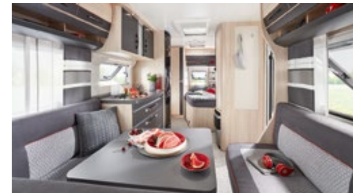
FURNITURE FINISH: Hamilton Maple light / Anthracite UPHOLSTERY COMBINATION: Patch (Picture shows Avus) RANGE: De Luxe Edition