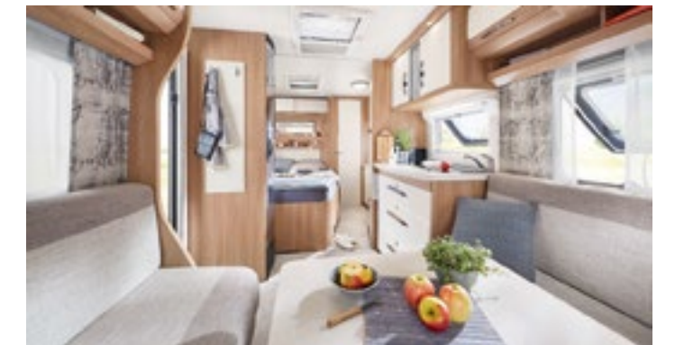
FURNITURE FINISH: Olmo Pavarotti / Uni Beige Matt UPHOLSTERY COMBINATION: Patch RANGE: De Luxe