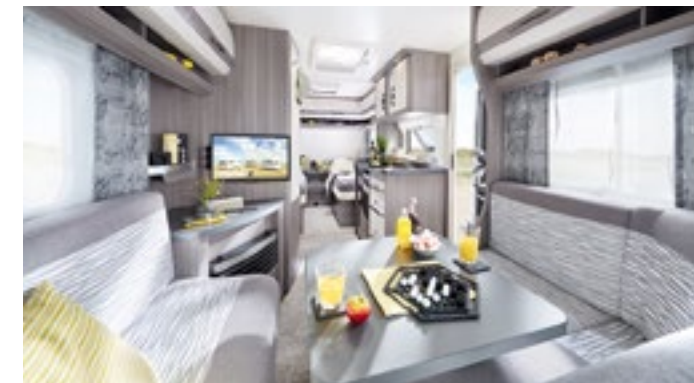
FURNITURE FINISH: Cocobolo / Piquet Grey UPHOLSTERY COMBINATION: Patch (Picture shows Taiga) RANGE: Ontour