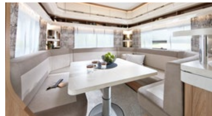
UPHOLSTERY COMBINATION: Sari