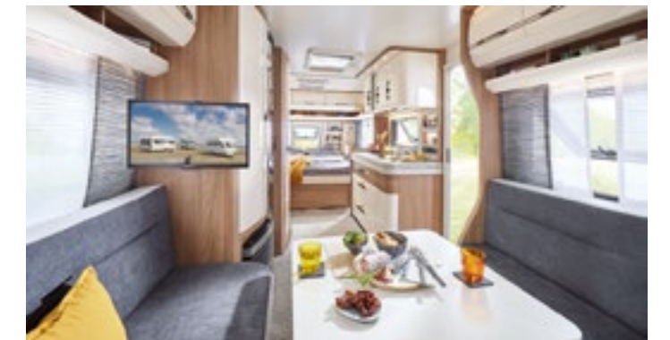
FURNITURE FINISH: Olmo Pavarotti / Magnolia UPHOLSTERY COMBINATION: Patch (Picture shows Stilo) RANGE: Excellent