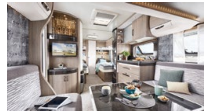
FURNITURE FINISH: Moyet Oak / White Leather UPHOLSTERY COMBINATION: Sari (Picture shows Taiga) RANGE: Prestige